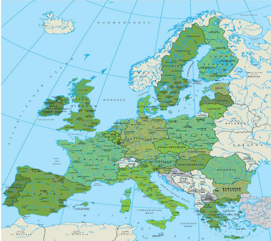
Europäische Gemeinschaften. Panorama der europäischen Union. 2009, p. 15. http://ec.europa.eu/publications/booklets/eu_glance/79/de.pdf